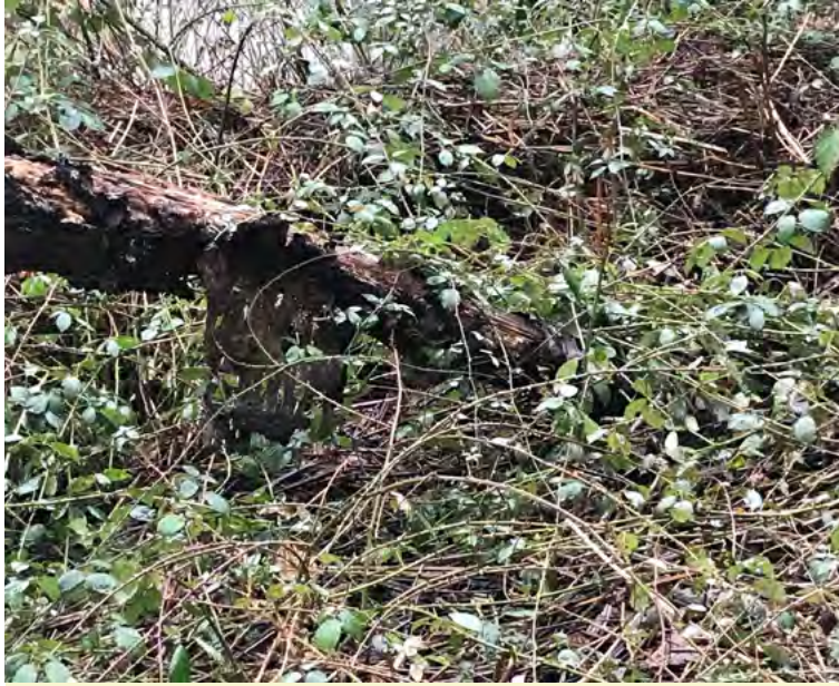
Before (February 1)