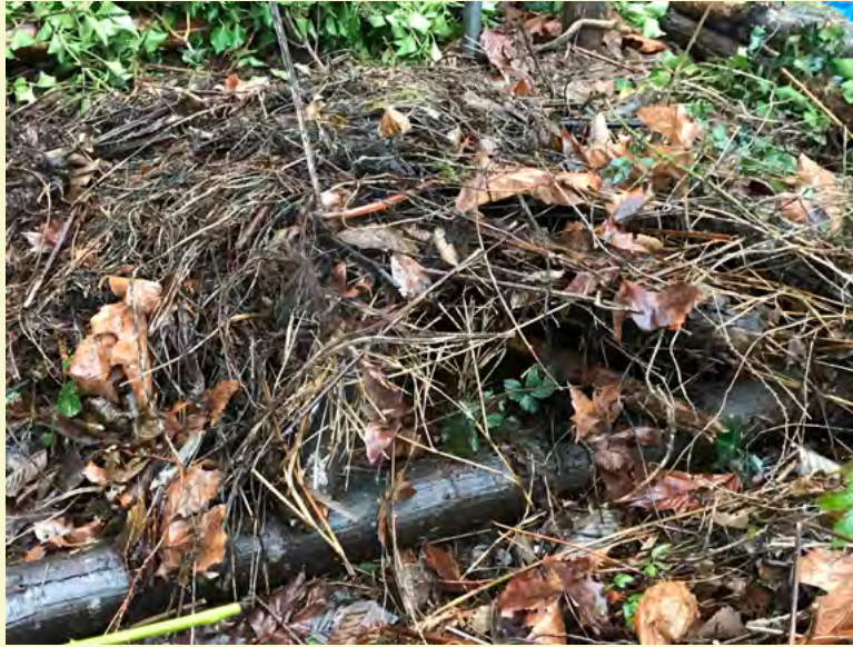
Rack that is ready to be rebuilt because the debris on top of it is dead.