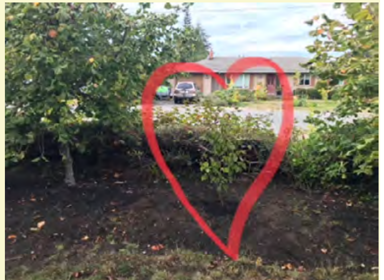
Qualicum Beach, BC