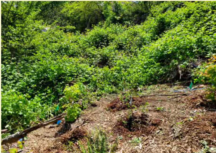
Southern planting area

Forty-five minutes into the work party, a welcome surprise arrived in the form of six members of the fraternity. I was excited to see them. I had the young men sign up and join the rest of our group in carrying the wood chips and building the rings.