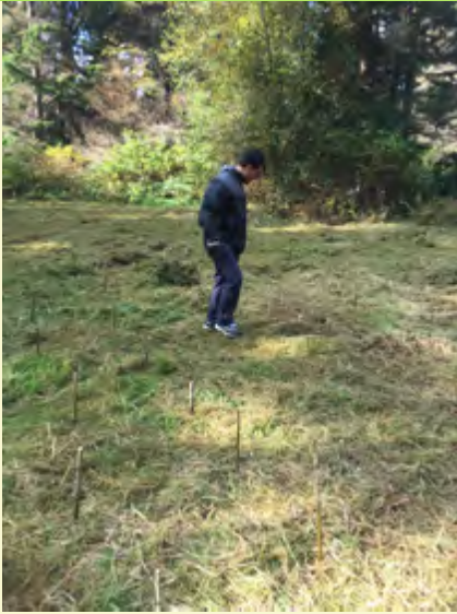
Maltby Live Willow Stakes