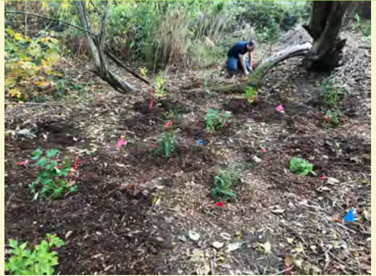
Seattle Greenbelt Restoration