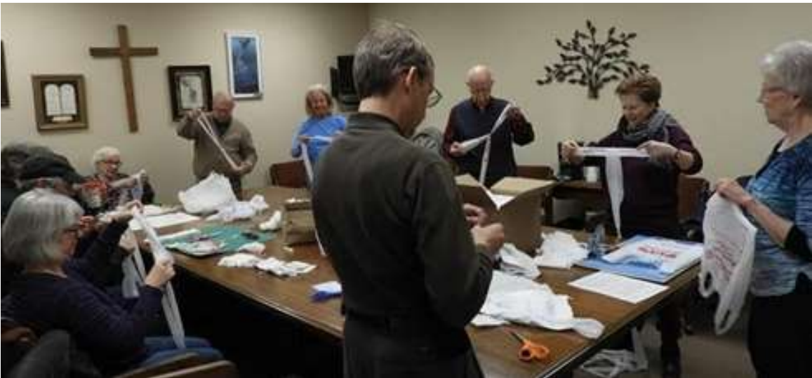
Oklahoma Satsang Plarning Plastic Bags into Sleeping Mats for the Homeless