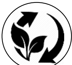
Sustainable Tour products and at Amma shop