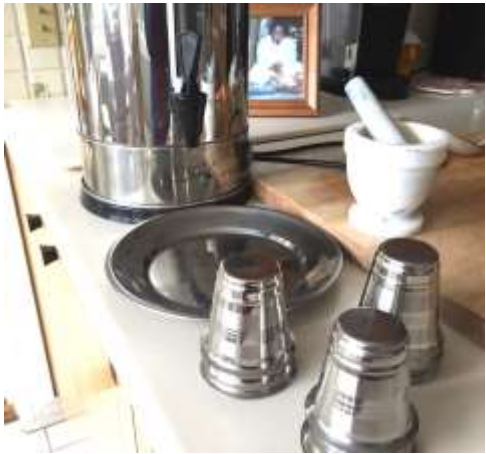
NE Ashram Replaced disposable chai cups with metal cups