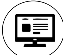
GreenFriends Source Reduction Webpages