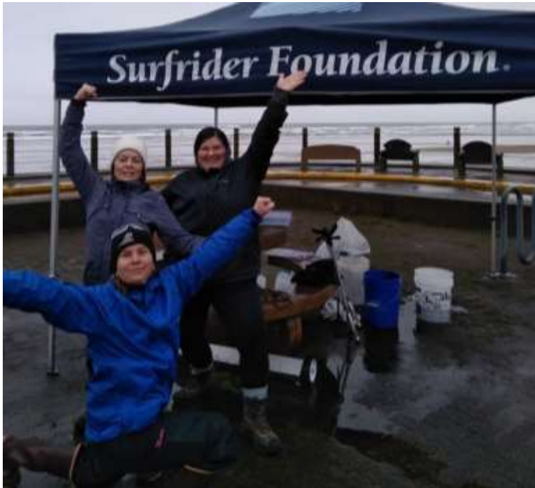
PNW Beach Cleanup