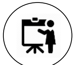
Satsang Presentations & Talks