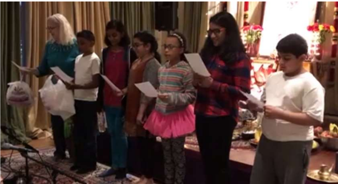
D.C. Source Reduction Song