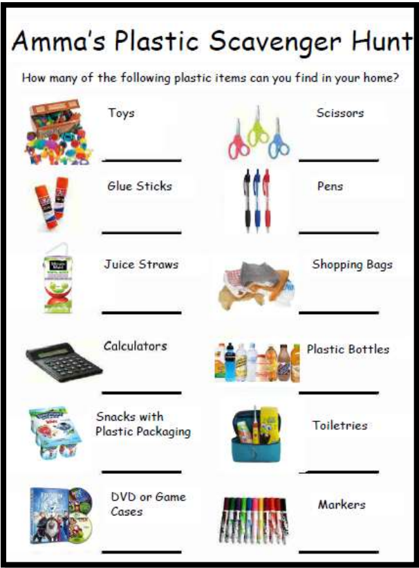
ATL ABK Scavenger Hunt