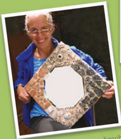
Achala's mosaic mirror - beach finds set around an octagonal mirror.

The list of ideas, projects, and potential materials for Upcycle Craft Days continues to grow. Please join us on Thursdays, between 9:30 and 1:30 in University Place. Contact Satyavati for more information: 253-566-3648