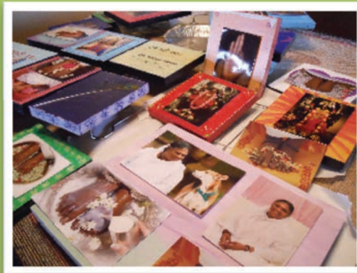
Satyavati's Icons - repurposed boards that are primed, painted, varnished and enhanced with divine photos and images.