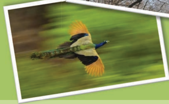
Peacock in flight

http://www.youtube.com/watch?v=-JrPRVMxA-s