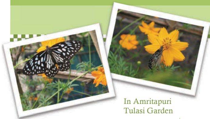
In Amritapuri Tulasi Garden

http://www.youtube.com/watch?v=-JrPRVMxA-s