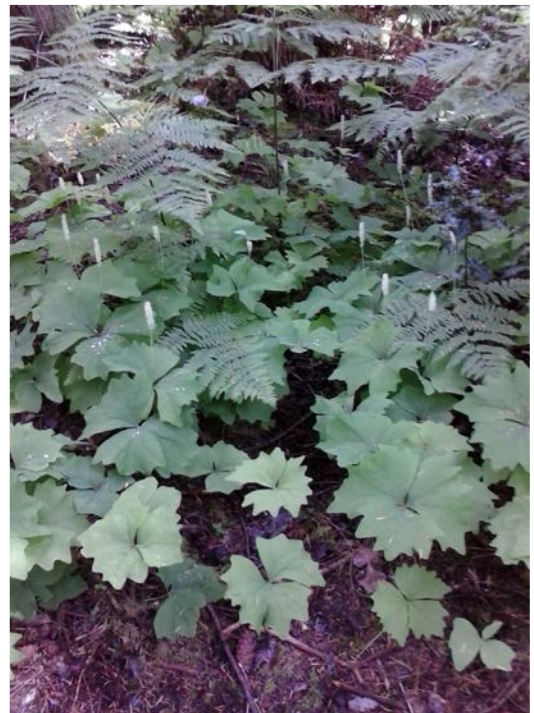
Batch of Vanilla leaf (notice the white stem flowers)