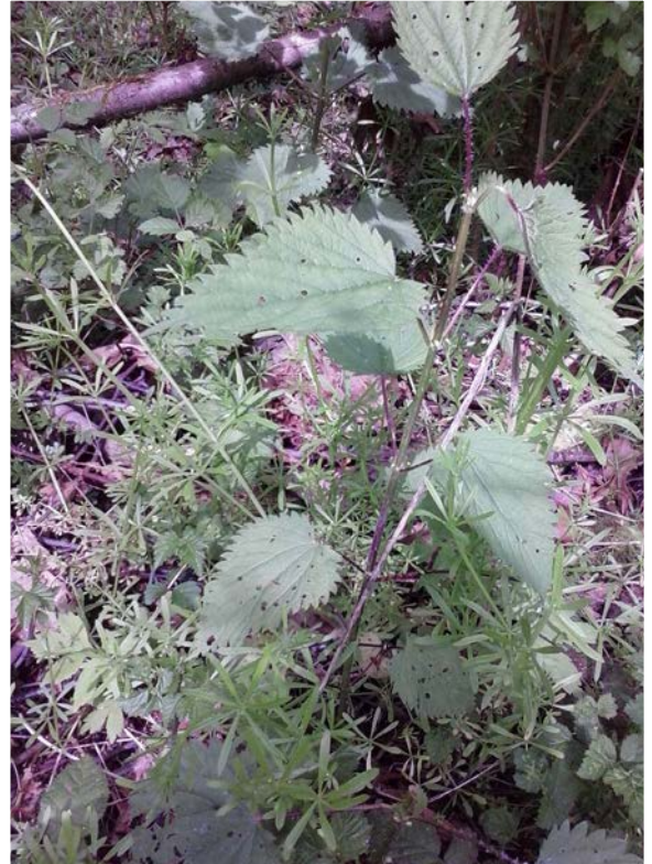
Stinging nettles with cleavers all around