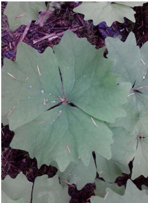
Vanilla leaf close up