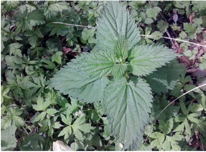
Stinging Nettles close up